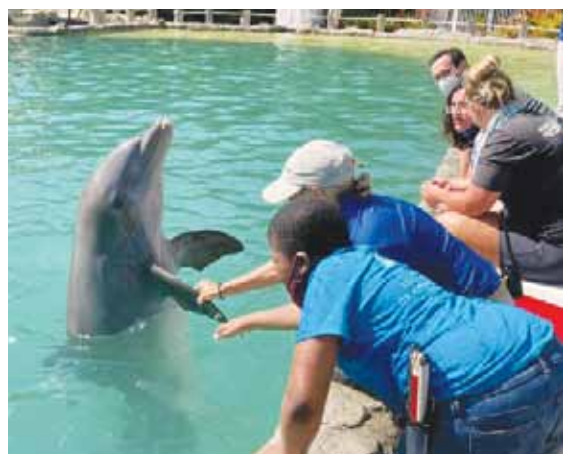
Students shake hands with a dolphin at Miami Seaquarium