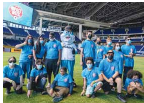
Our Transition Program students at loanDepot Park

Blind and visually impaired participants in the Miami Lighthouse’s Pre-Employment Transition Program for teenagers enjoyed Marlins Impact Day at the ballpark courtesy of the Miami Marlins Foundation and UKG. Their visit began with a beep baseball game on the field followed by a touch tour of loanDepot Park led by the Miami Marlins staff. Beep baseball is a form of baseball that can be played by people who are visually impaired using a ball that emits a beeping sound. Miami Lighthouse’s Transition Program students are taught to hit the ball using their sense of hearing.