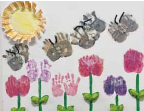
Spring Garden: third place in the preschool/kindergarten competition.