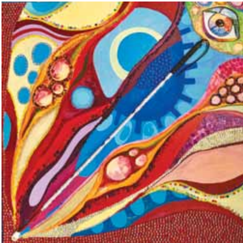
White Cane Energy: second place in the two-dimensional category. Twelve Senior Group Health and Activities Program (SGA) artists participated in the creation of this 48" x 48" mixed media painting.