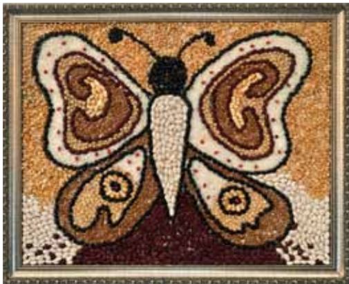
Mariposa: third place in the two-dimensional category, a textured artwork with dried beans, corn and rice created by a participant in our SGA Program.

We reported in our last newsletter that artistic works by several of our talented students and adults were entered into the American Printing House for the Blind (APH) annual InSights competition, an international art contest open to artists of all ages who are blind or visually impaired. We are pleased to let you know that several of our submissions won prizes and two received honorable mention. The director told us that Miami Lighthouse had the highest number of winning entries of any organization and that the quality of our art was amazing. The prize-winning artworks are shown below.