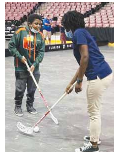
Facing off at the BB&T Center

Miami Lighthouse Transition Program teenage students got the opportunity to take part in a hands-on hockey clinic thanks to the Florida Panthers Foundation. The teenagers played floorball in the bowl of the BB&T Center. Prior to the clinic, they also participated in a career development panel. Miami Lighthouse has been the recipient of a Community Champions grant from the Florida Panthers Foundation to help us provide financially disadvantaged Florida students the opportunity to receive eye exams and prescription glasses at no cost through our Florida Heiken Children’s Vision Program.