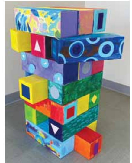
Jenga: second place in the preschool/kindergarten competition.